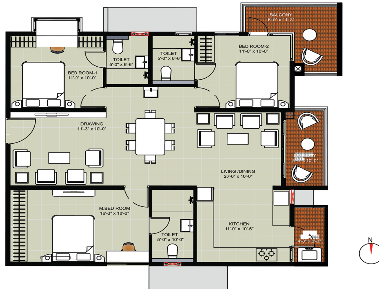
FLOOR PLAN - 3BHK , TYPE -4 Saleable Area 1570 Sq.ft