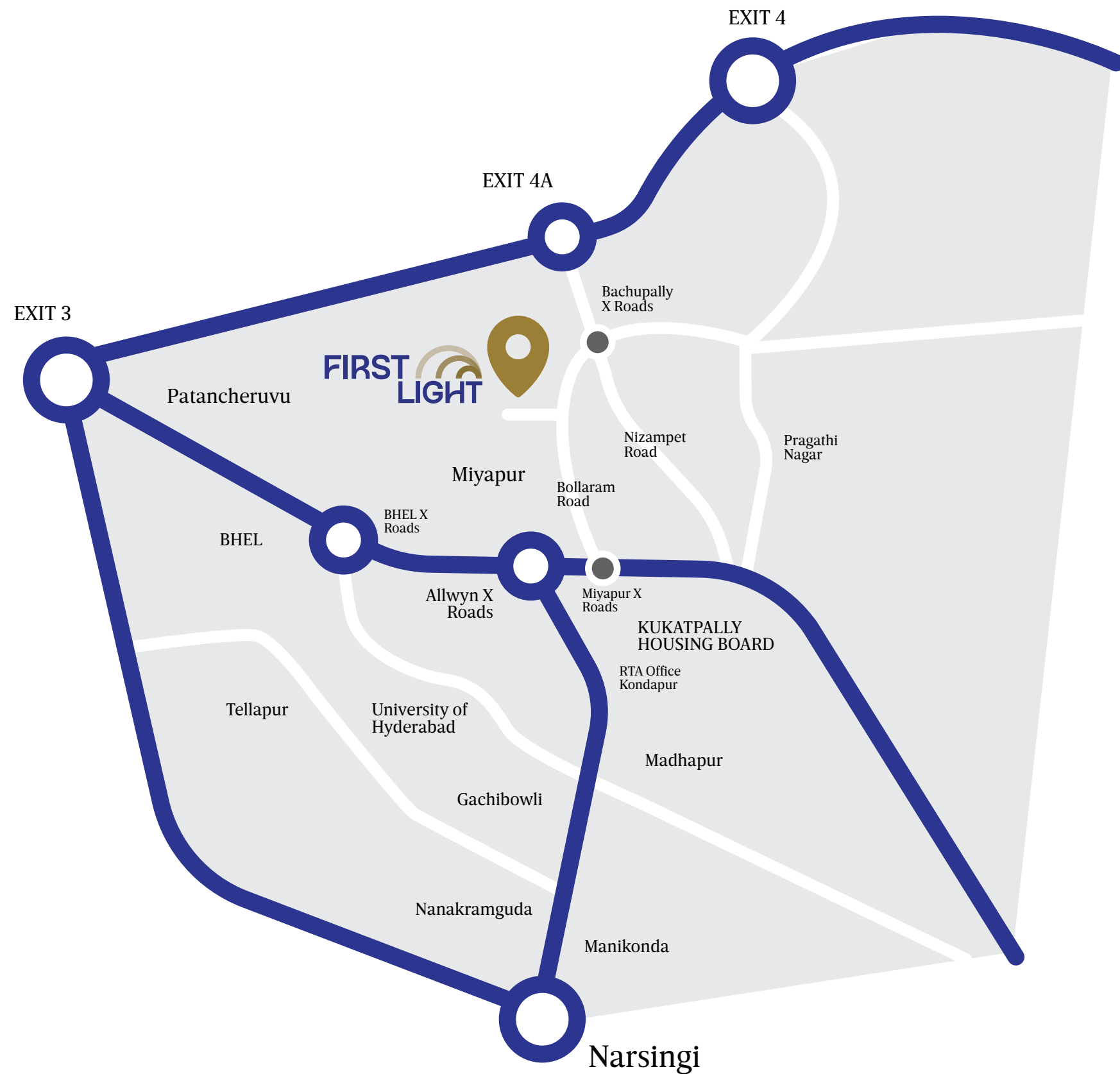
Location Map (Not for scale)

A birds-eye view above the beautiful city of Hyderabad, First Light lies on the Miyapur-Bachupally main road. Here's where you come to dull the sounds, and elevate the senses.